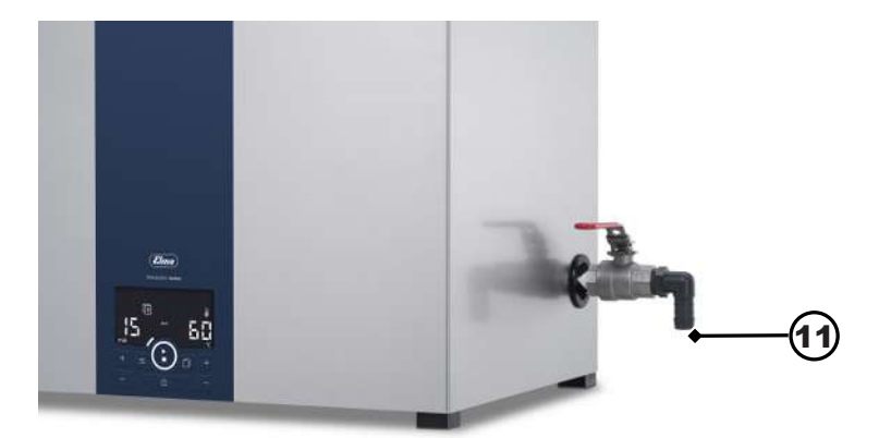
Illustration 3: Drain of Elmasonic Select 500/900