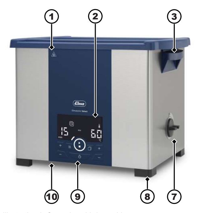
Illustration 2: Operating side/rear side