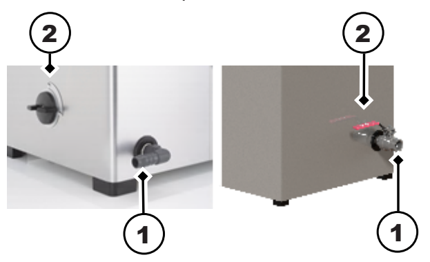
Illustration 6: Drain of Elmasonic Select 60-300/500/900