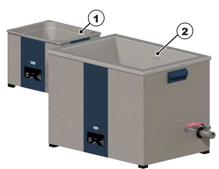
Illustration 5: Elmasonic Select 30-900 fill level marking