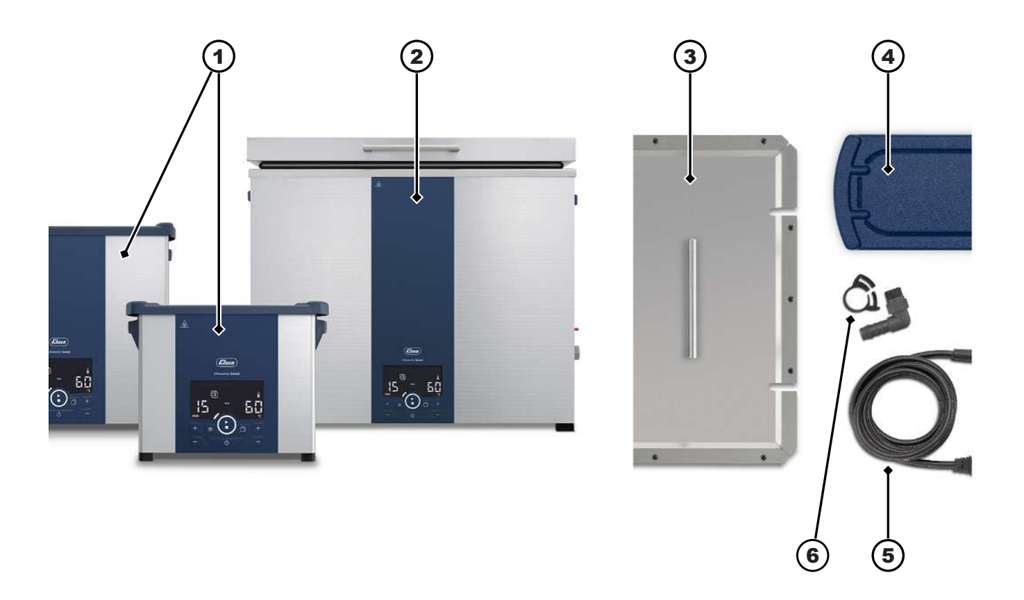
Illustration 1: Included items (schematic diagram)

Dispose of packaging materials that are no longer required in an environmentally friendly manner.