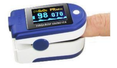
Figure 4. Put finger in position

Medium priority indicating that prompt operator response is required.