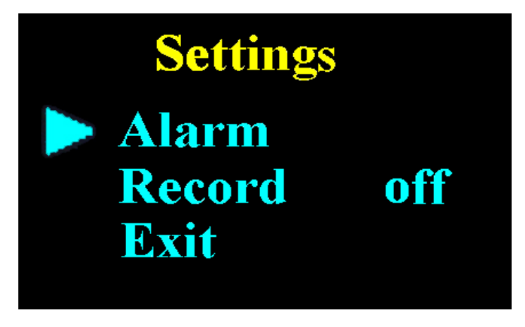
Figure 7. Main Menu Interface