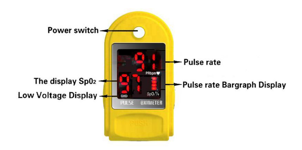
Figure 2. Front View