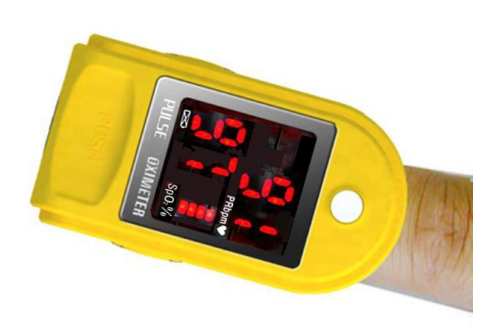
Figure 5. Put finger in position