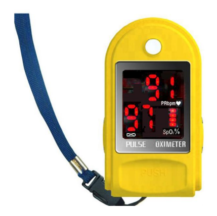
Figure 4. Mounting the hanging rope