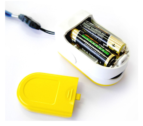
Figure 3. Batteries Installation

Please take care when you insert the batteries for the improper insertion may damage the device.