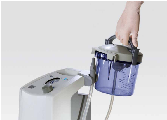
Removal of the secretion tank

During a surgical operation, the patient needs all the attention. Therefore the medical team needs to rely on powerful systems that work impeccably. Such is the infinitely variable VC 45 Surgical Suction Unit that meets surgical requirements with a suction volume of 45 l/min with a constant high vacuum of up to 910 mbar.