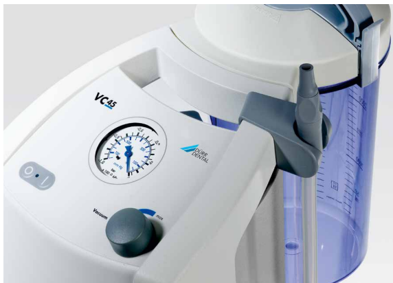
Maximum vacuum of up to 910 mbar