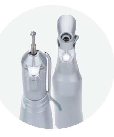
S-11 LED G WS-75 LED G

Operate by daylight quality light — and with a self-sufficient light source The new W&H surgical instruments with LED produce perfect daylight quality light all on their own. This is down to the integrated generator that supplies energy to the LEDs.