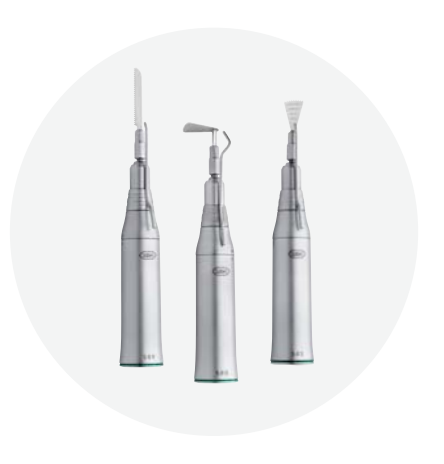
S-8 R S-8 O S-8 S

removal with sagittal, oscillating or reciprocal movement. Whichever direction you choose: with W&H, you will have a reliable partner at your side.