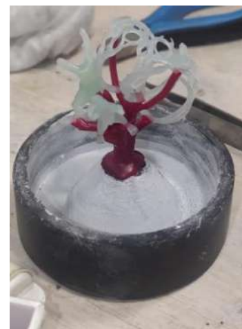
Fig.2 Post cured parts.

The information above is believed to be accurate and represents the best information currently available to us. All test specimens were printed, cleaned, and post-processed per instructions provided by HARZ Labs company. Results provided here are representative of these processes and may vary if these established protocols are not followed. Users should make their own investigations to determine the suitability of the information for their particular purposes. In no event shall HARZ Labs LLC (ООО «ХАРЦ Лабс») be liable for any claims, losses, or damages of any third party or for lost profits or any special, indirect, incidental, consequential or exemplary damages, however arising, even if HARZ Labs LLC (ООО «ХАРЦ Лабс») has been advised of the possibility of such damages.