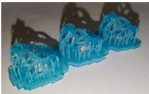
Fig.1 Initial color of printed parts.

The printed pieces should be rinsed with isopropyl alcohol (IPA) or immersed in ultrasonic bath filled with IPA for 30 sec, then manually washed with water followed by IPA. The washing cycles should be done until the parts will be free of liquid resin. Manual washing with soft paint brush could facilitate the cleaning process. After 3 cycles if the parts are still in resin it is desired to continue cleaning process in 5% detergent solution in order not to dissolve surface of printed part (negative defects could appear after investment casting). Afterwards, printed parts recommended to blow with compressed air and finally dried at 80oC for 30 minutes. Post curing in UV chambers under glycerol (in order to achieve better curing of printed parts surface) until the part will change color from blue to semitransparent (Fig.1, Fig.2).