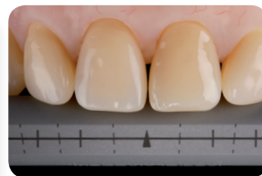
Reference scale 2