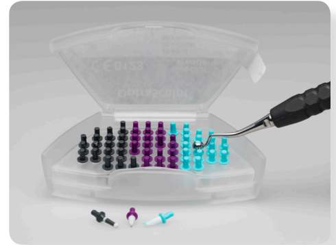
Hygienic storage container for easy access to tips