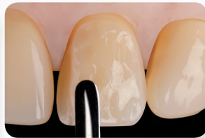
Shaping and contouring with a metal spatula