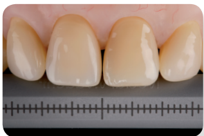
Reference scale 1