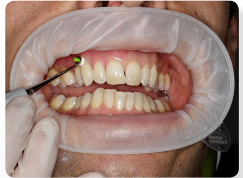
Optimum working angle for the anterior region