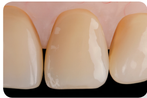
Result achieved with OptraSculpt Pad