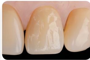
Result achieved with a metal spatula