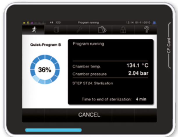
The sterilization run is displayed in a clear and easy-to-read fashion.