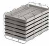
Mount >C< for 6 trays

Autoclaves need not just to be quick, but also economical. Autoclaves of the Premium-Plus-Class can sterilize up to 6 standard trays or 4 MELAstore-Boxes 100 simultaneously. We provide a number of mounts for this purpose. The autoclave scope of delivery includes one mount. The mount >C< is especially versatile as it can be used both for trays as well as MELAstore-Boxes 100 (upon rotating the mount 90°).