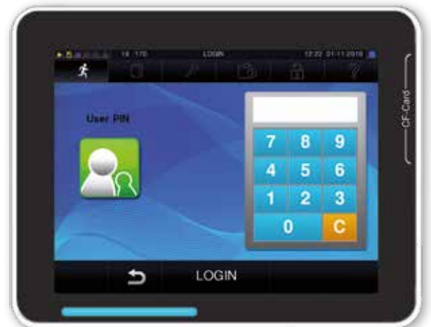
Individual operator PINs