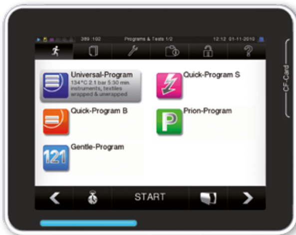
The menu for selecting the sterilization programs

Autoclave operation needs to be simple, error-free and fun. The intuitive operation of the autoclave using an extra-large colour-touch-display enables quick program selection, options settings, individualization of the display colour and much more. This display is unique, providing as it does, the world's largest colour-touch-display to be found in a large-scale production practice autoclave.