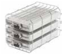
Mount >C< (rotated) for 3 MELAstore-Boxes 100