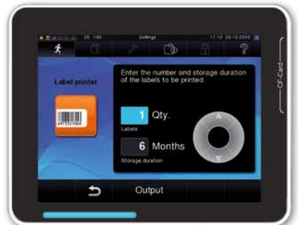
Selecting the number of labels and maximum storage period