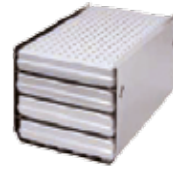
Mount >B< for 4 standard tray cassettes