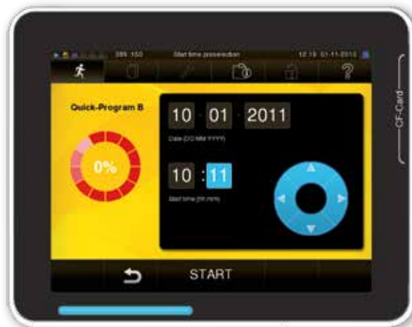
Time pre-selection for automatic autoclave start

As a family-owned company taking a long-term perspective, MELAG has a long record of environmental responsibility and resource-conservation. Our development and production operations always aim to conserve energy. Our Premium-Plus-Class autoclaves are all fitted with an