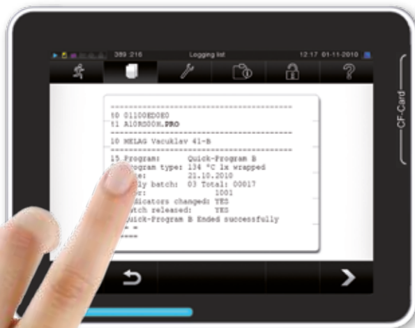
View the log on the display

Many practice workers see documentation as a necessary but unpleasant task. The new operating concept and the large colour-touch-display enable a documentation procedure which saves time and is fun to use.