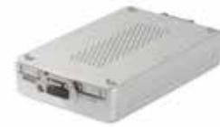
MELAstore-Box 100 and 200