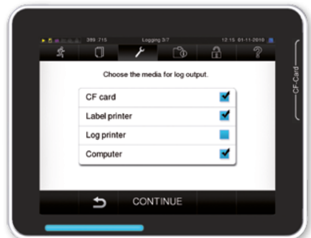
Individual and multiple output media can be selected very easily

Premium-Plus-Class autoclaves represent a modern system catering for the needs of every practice, including documentation via your practice network, the Ethernet system interface and barcode label printing up to log issue on the CF card or the MELAprint 42 log printer.