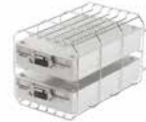
Mount >D< for 2 MELAstore-Boxes 200