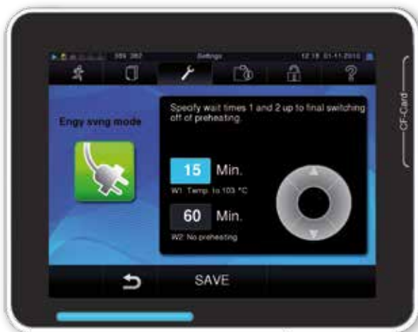
The settings in the energy-saving mode

The contribution of intelligent systems to time saving and environment protection