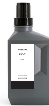
ESD-T ● Black

Reduce costs, iterate faster, and bring a better experience to 3D printing.