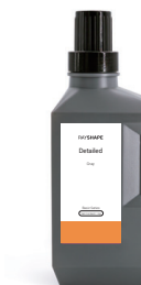
Detailed ● Orange Yellow