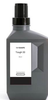
Tough 20 ● Black ○ White