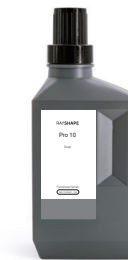
Pro 10 ● Dark Gray