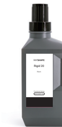
Rigid 20 ● Black