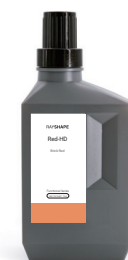
Red-HD ● Brick Red