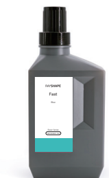
Fast ● Lake Blue