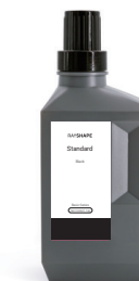
Standard ● Black ○ White ● Gray

Common materials and rapid prototyping. High-quality finishing, high dimensional accuracy, and excellent detail.