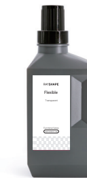
Flexible ○ Clear