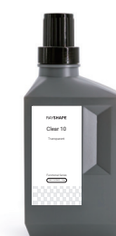
Clear 10 ○ Clear