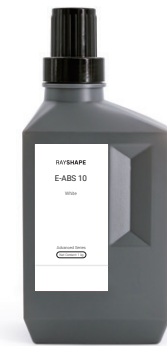
E-ABS 10 ○ White

The material offers a good balance of impact, heat, chemical and abrasion resistance.