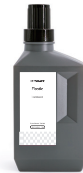
Elastic ○ Clear