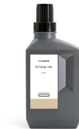
Hi-Temp 160 ● Amber