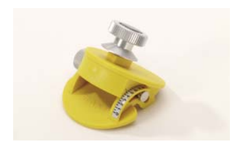
Options: Adjustable Incisal Table