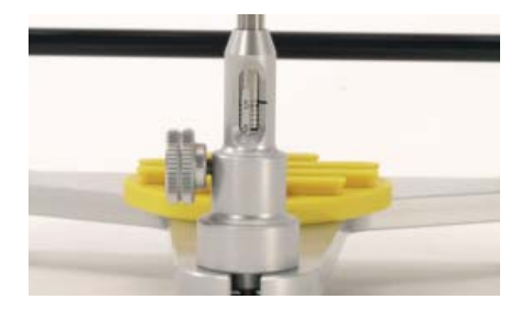
Incisal pin with numeric scale