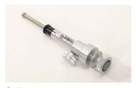
Options: Micro Adjustable Incisal Pin