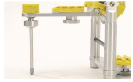
Vertical Support Rod for upper member of articulator.