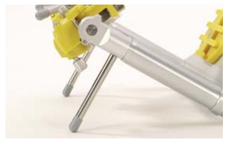
Tilt support rods for angular positioning of articulator