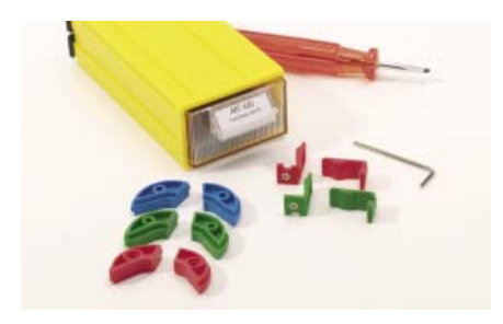
Options: Bennett and Condylar Insert Set PX