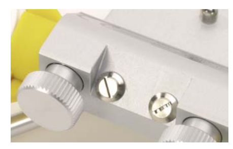
Visible high quality and precision assures reliability and longevity