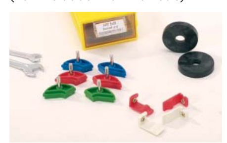
Options: Bennett and Condylar Insert Set 3