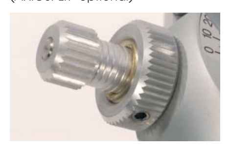
Micro Adjustable Protrusion (to 6 mm) and Retrusion (to 2 mm) Screw (not included in SAM 3 Basic)