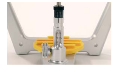
Micro Adjustable Incisal Pin (included in SAM 3 Professional)