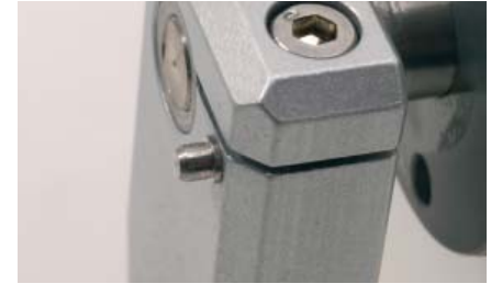
Facebow earpiece pin