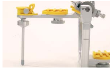
Vertical Support Rod for upper member of articulator.