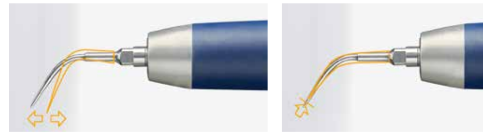
Up - down and forwards - backwards. The two-dimensional oscillation of the tip acts gently on the tooth being treated.

A great combination: The ideal result - regardless of the type of treatment - depends on the ideal combination of scaler and tip. By optimally matching the two components, Dentsply Sirona ensures consistent high quality. This has produced ultrasonic scalers that are flexible and easy to use with a selection of tips designed to be used in specific treatment areas.