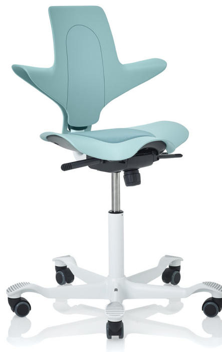
Design: Peter Opsvik. Patent- and design protected.