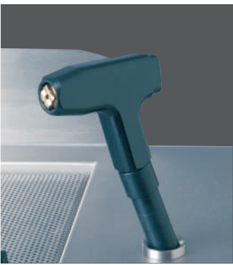
Hand spray for manual scalding