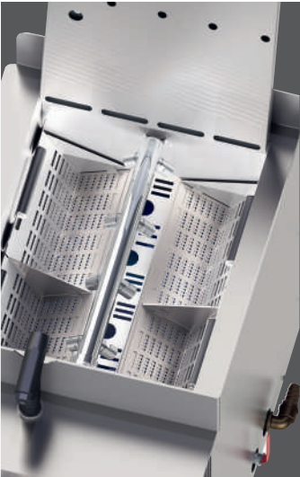
Convenient boil out process, easy access to flask baskets