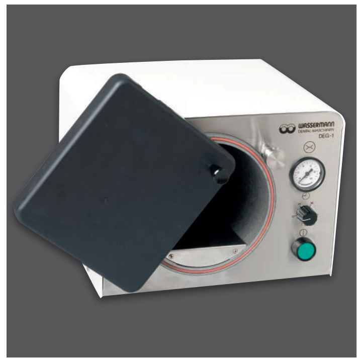
Rotatable door with quick fastener