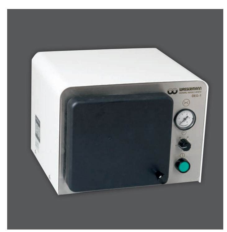
Designed to take several muffles at the same time