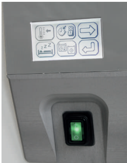
Self-explanatory symbols, fast and easy operation