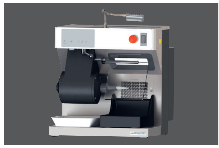
WP-Ex 10 II with special accessory daylight LED spot