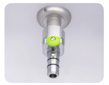
Adaptors for all situations The two chambers can be equipped with corresponding adaptors to suit your requirements.

Now I have the certainty that my instruments can be reprocessed between treatments without additional waiting times for me or my patients. It's a win-win situation for my practice.